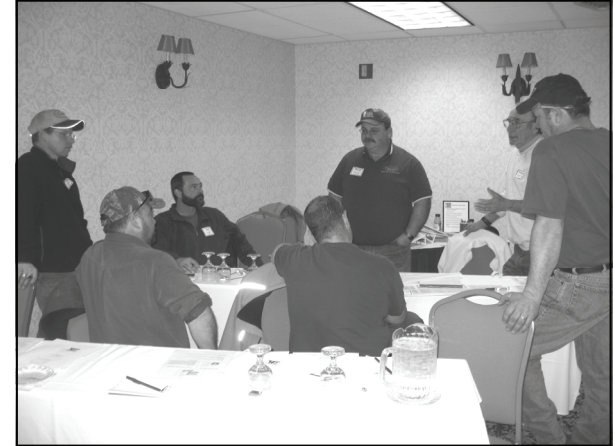
Participants from a previous session of this workshop collaborate on a group exercise.

2012 Workshop Series presented by the VERMONT LOCAL ROADS PROGRAM Sponsored jointly by the Federal Highway Administration and the Vermont Agency of Transportation